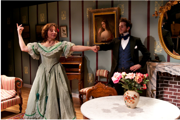
Scene from "Summer at Nohant" by Jaroslaw Iwaszkiewicz