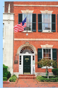
Arts Club of Washington, 2017 | St. NW, Washington, DC 20006

We look forward to hosting our ACPC guests and welcoming them along with the PAAA members and friends.