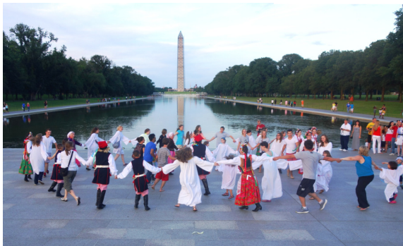
Performers and audience danced and sang together until late in the evening