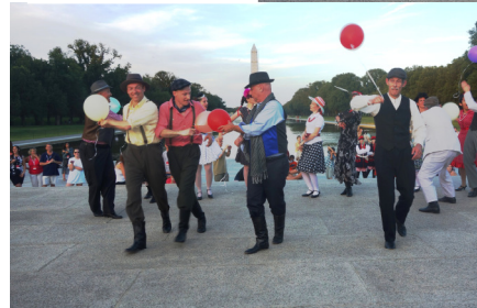
Above: Krakowiak Center: Dances from Nowy Sącz Left: Old Warsaw Polka