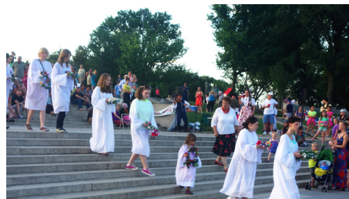
Girls carry wreaths to the water