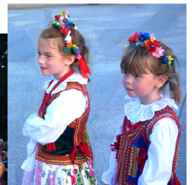
Two young Krakowiaki Dance Group members