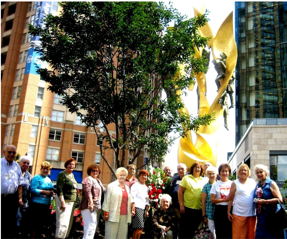
Convention participants at the Katyn Memorial in Baltimore's Inner Harbor